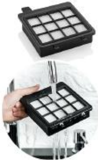
Washable EPA E11 filter