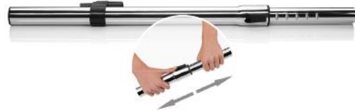
Telescopic metal tube