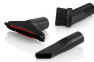
A set of suction nozzles and brushes